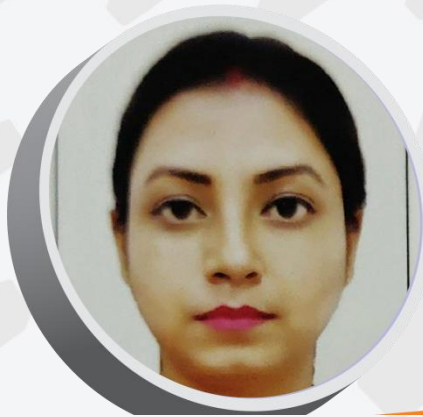
SUPARNA RAJE West Bengal