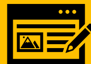
POST PAYMENT FORM

Attach this form, documents applicable* (refer next slide-number 21), the screenshot/picture of the payment confirmation, Post Payment Form and mail it to: jyoti.singh@vakrangee.in and keep the state head in CC , the mail id of state heads can be found in the below document